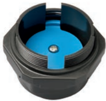
Photo: Inside view